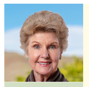
AGE: 73 CLASS: III

The following paragraphs describe the business experience and education of our Class I and Class III directors (not standing for reelection).